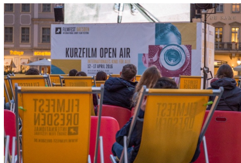
2016 Short Film Open-Air