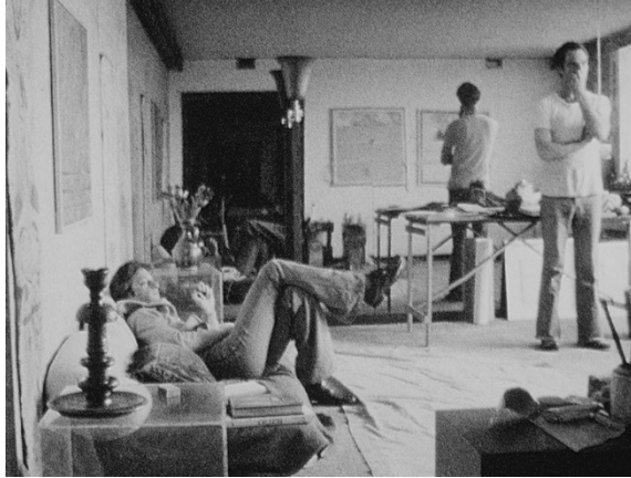
Tribute 2: Derek Jarman – SLOAN SQUARE – 1976

opportunities to hold chats and discussions with the filmmakers in attendance, such as at the Q&A sessions after the screenings, or during the " Sandwich Talks " in the Filmgalerie Phase IV venue (National Competition from 10 to 12 April at 19.00 in each case; International Competition from 10 to 12 April at 17.00 in each case).