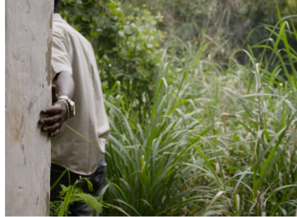
Focus on Cuba 1: BATERÍA from Damián Sainz - 2016