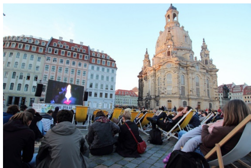
Record visitor numbers at the 2018 Short Film Open-Air