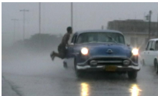
Exhibition Surfing Buena Vista © Alfredo Ramos Fernández – 2009

http://www.filmfest-dresden.de/files/filmfest/2019/PDF-Dateien/FFD31_FLYER-Kids-Jugend_digital.pdf