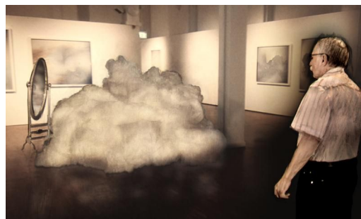
Central Museum